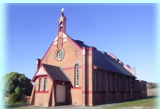
Immaculate Conception, Omeo