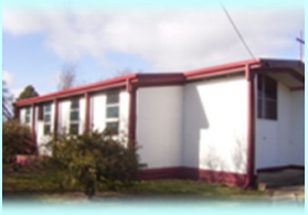
St Francis of Assisi Benambra