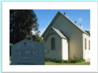
St Canice's Lindenow