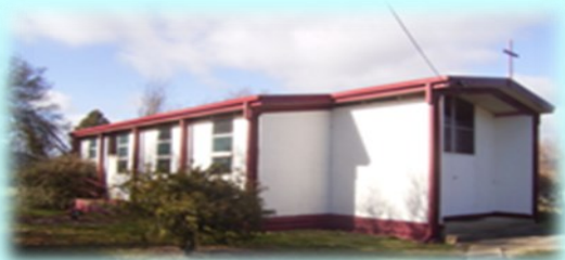
St. Francis of Assisi, Benambra