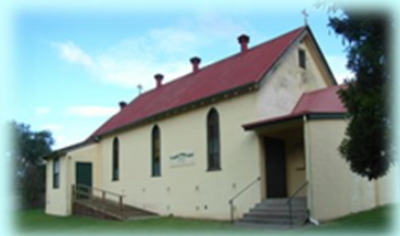
St. Patrick's Paynesville