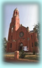
St Mary's Bairnsdale