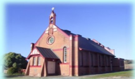
Immaculate Conception, Omeo