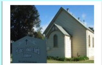
St Canice's Lindenow