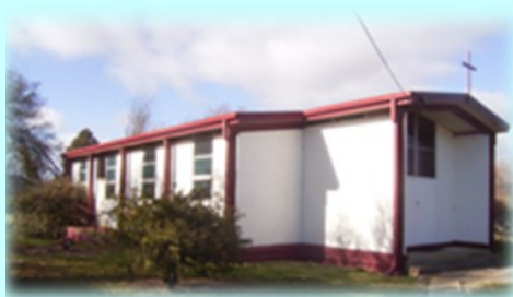
St Francis of Assisi, Benambra