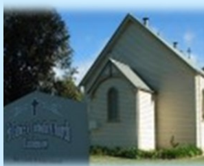
St Canice's, Lindenow