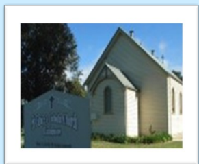
St Canice's, Lindenow