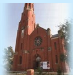
St Mary's, Bairnsdale