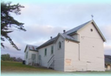
Sacred Heart, Swifts Creek