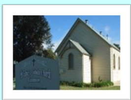
St Canice's, Lindenow