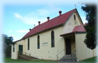
St Patrick's, Paynesville