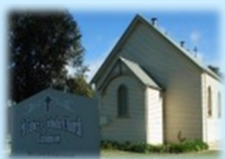
St Canice's Lindenow