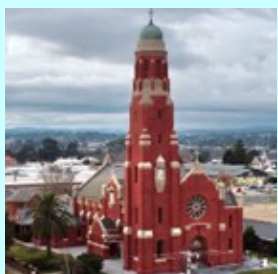
St Mary's, Bairnsdale