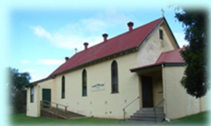
St Patrick's, Paynesville