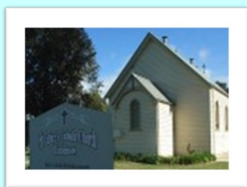
St Canice's Lindenow