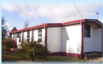
St Francis of Assisi, Benambra