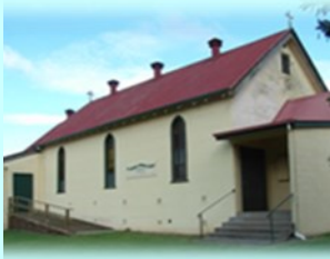
St Patrick's, Paynesville