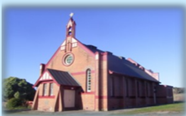
Immaculate Conception, Omeo