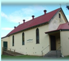
St Patrick's -Paynesville