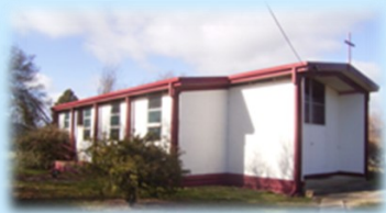
St Francis of Assisi, Benambra