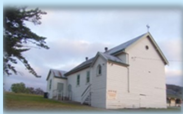
Sacred Heart, Swifts Creek