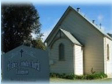
St Canice's Lindenow