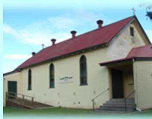
St Patrick's Paynesville