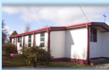
St Francis of Assisi, Benambra