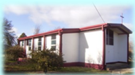
St Francis of Assisi, Benambra