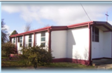
St Francis of Assisi Benamabra