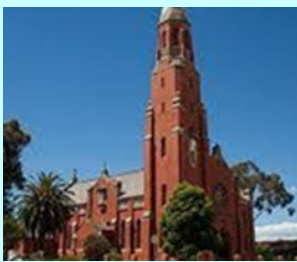
St Mary's Bairnsdale