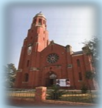
St Mary's, Bairnsdale