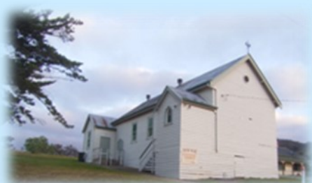
Swifts Creek: Sacred Heart