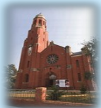
St Mary's, Bairnsdale