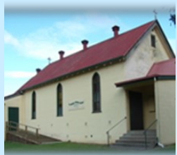
St Patrick's, Paynesville