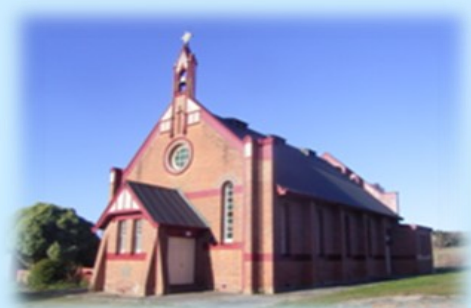
Our Lady of Immaculate Conception - Omeo