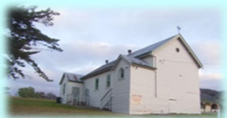
Sacred Heart, Swifts Creek