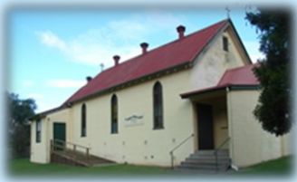
St Patrick's, Paynesville