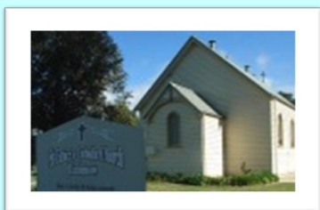
St Canice's Lindenow