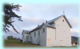
Sacred Heart, Swifts Creek.