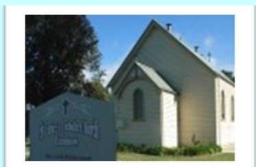
St Canice's , Lindenow