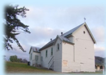
Swifts Creek: Sacred Heart